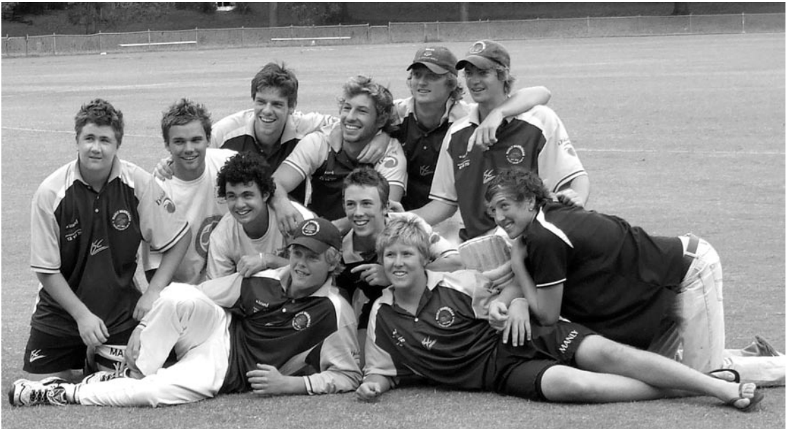
POIDEVIN-GRAY TEAM 2005/06