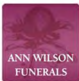
Ann Wilson Funerals