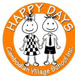
Happy Days Cambodian Charity