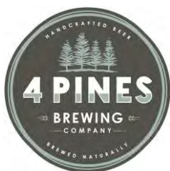
4 Pines Brewery