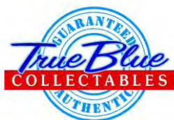
True Blue Collectable – Tim Cruickshank