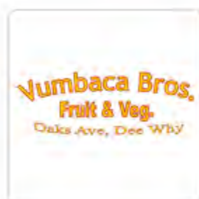
Vumbaca Fruit and Vegetables