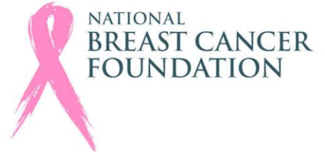
National Breast Cancer Foundation