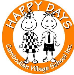
Happy Days Cambodian Charity